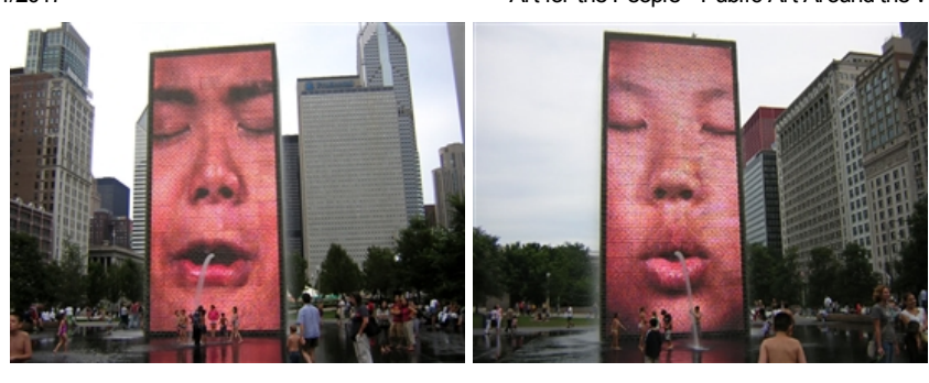
Anish Kapoor, Cloud Gate; Jaume Plensa, Crown Fountain