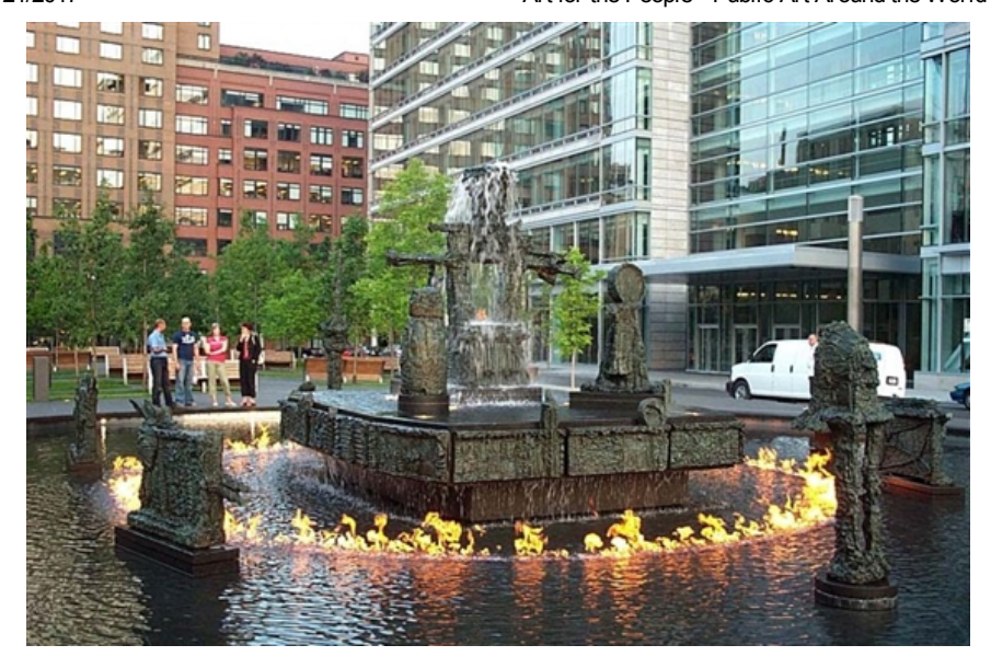
Jean-Paul Riopelle, La Joute.

La Joute, which was created in 1969, is a lively kinetic sculpture that produces a 32 minute sequence involving fire, water and movement. The complex mechanism begins its "show" spewing water into dome-like shapes that are joined by mist emanating from the grates surrounding the fountain. The mist conjoins into a cloud around 18 minutes later, and the fountain jets dissipate to a dribble. Natural gas is then pumped in and lit into flames which dance on the water for seven minutes before being put out by the fountain itself. The incredible show repeats itself every hour from 7 to 11 pm, from mid-May to mid-October.