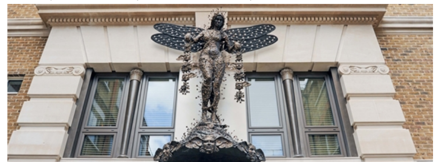
Hew Locke, Selene.

Commissioned by the Nadler Soho Hotel, Hew Locke's Selene is a new permanent sculpture on Carlilse Street, in London's Soho neighborhood. The ornate sculpture depicts the goddess of moon and magic, representing Sleep. Inspired by Art Nouveau and Victorian fairy paintings, Locke gave Selene a modern twist, infusing the visual influence of the local drag queens that frequent the Soho streets, David Bowie references (with the inclusion of dragon fruit flowers) and Selene 's presence as the depiction of a black woman, which is rare in the public sculpture of London.